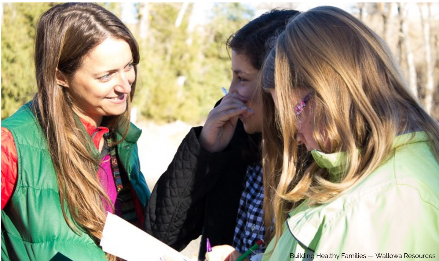
Building Healthy Families — Wallowa Resources

Intentionally checking in with youth helps staff to build positive, trusting relationships by expressing an interest in who youth are outside of school and programming. This is reflected in youth responses to a survey administered as part of the Initiative; a majority of youth responded that they know at least one adult at their program who cares about them and that they believe the adults in their programs take time to get to know them.