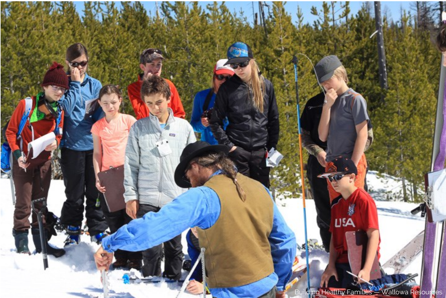
Building Healthy Families — Wallowa Resources