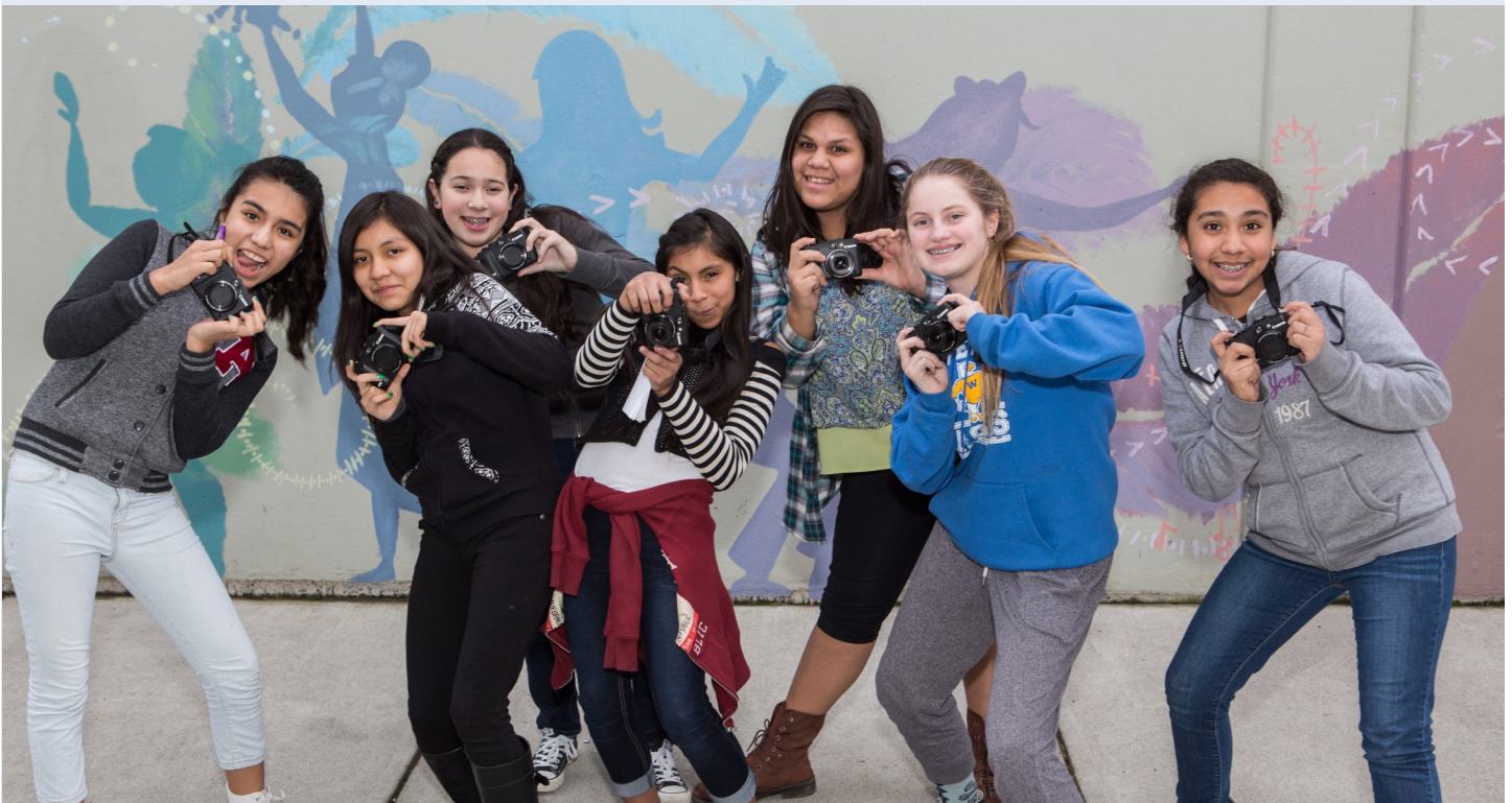
Wy'east Middle School, Hood River