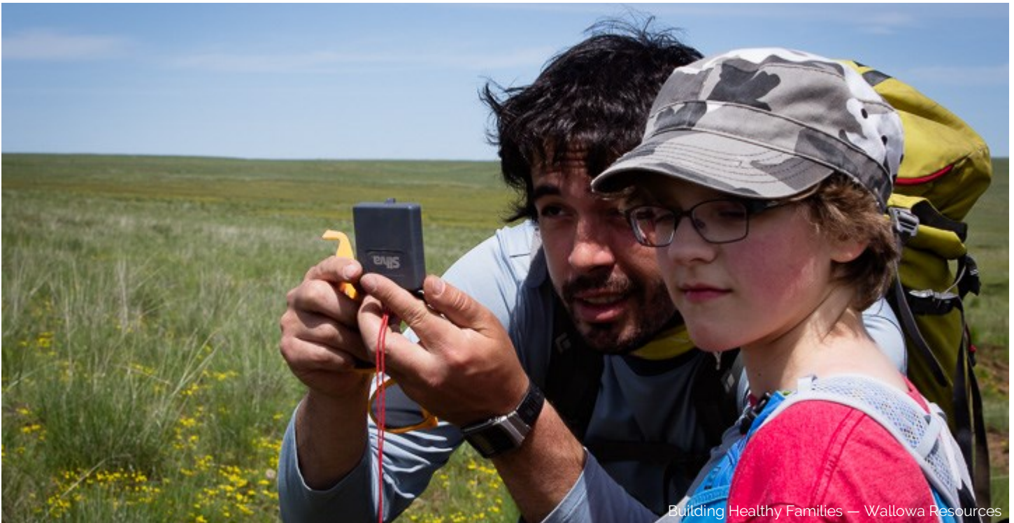
Building Healthy Families — Wallowa Resources