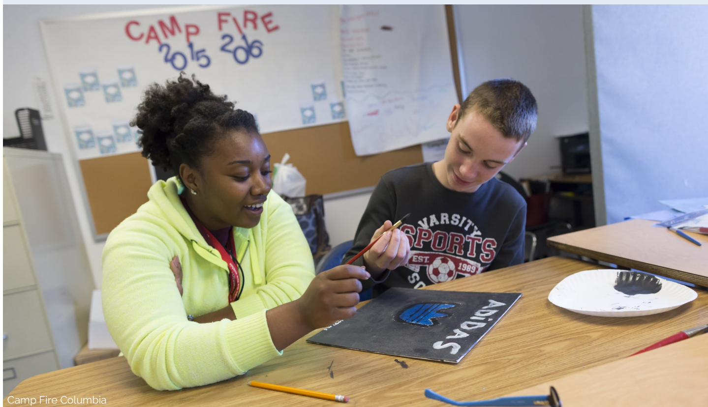
Camp Fire Columbia